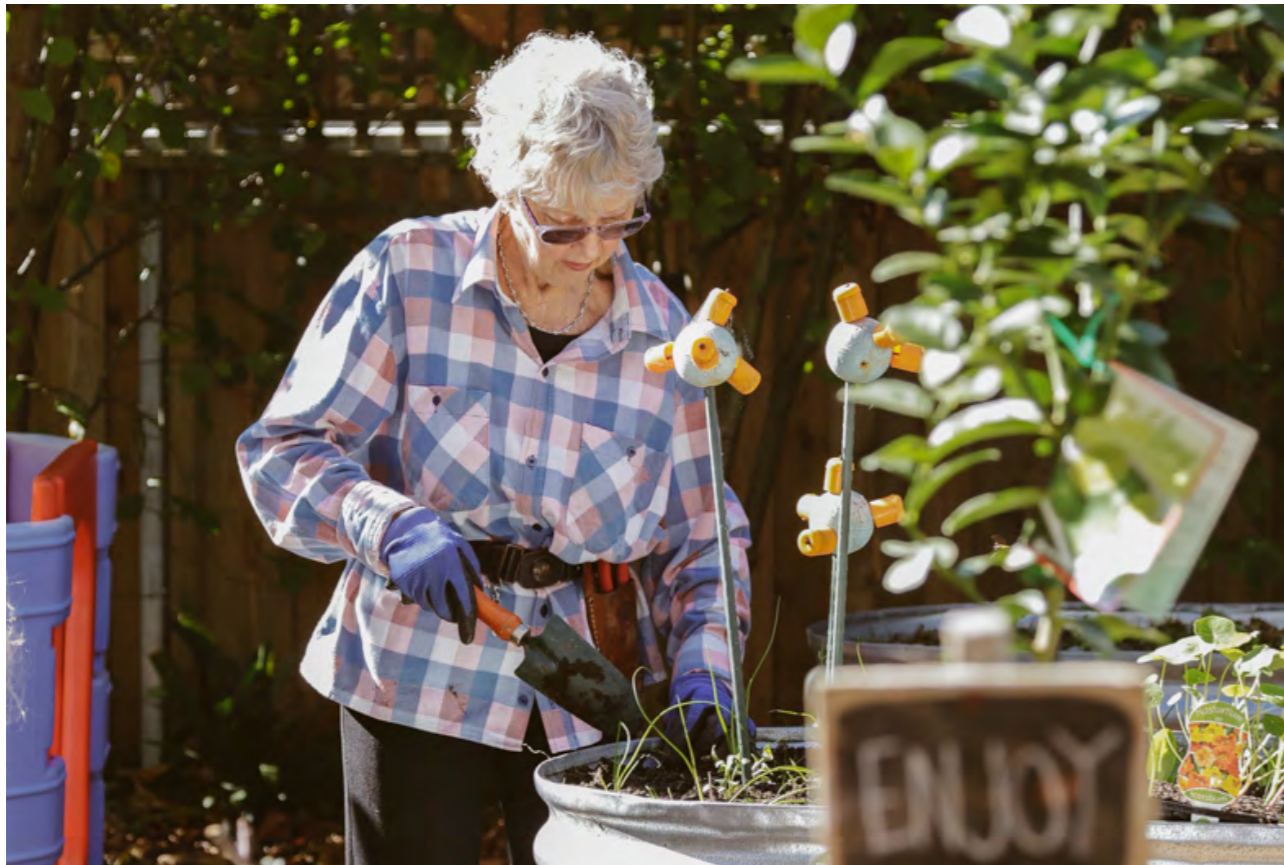
Community garden at the Alphington Community Centre