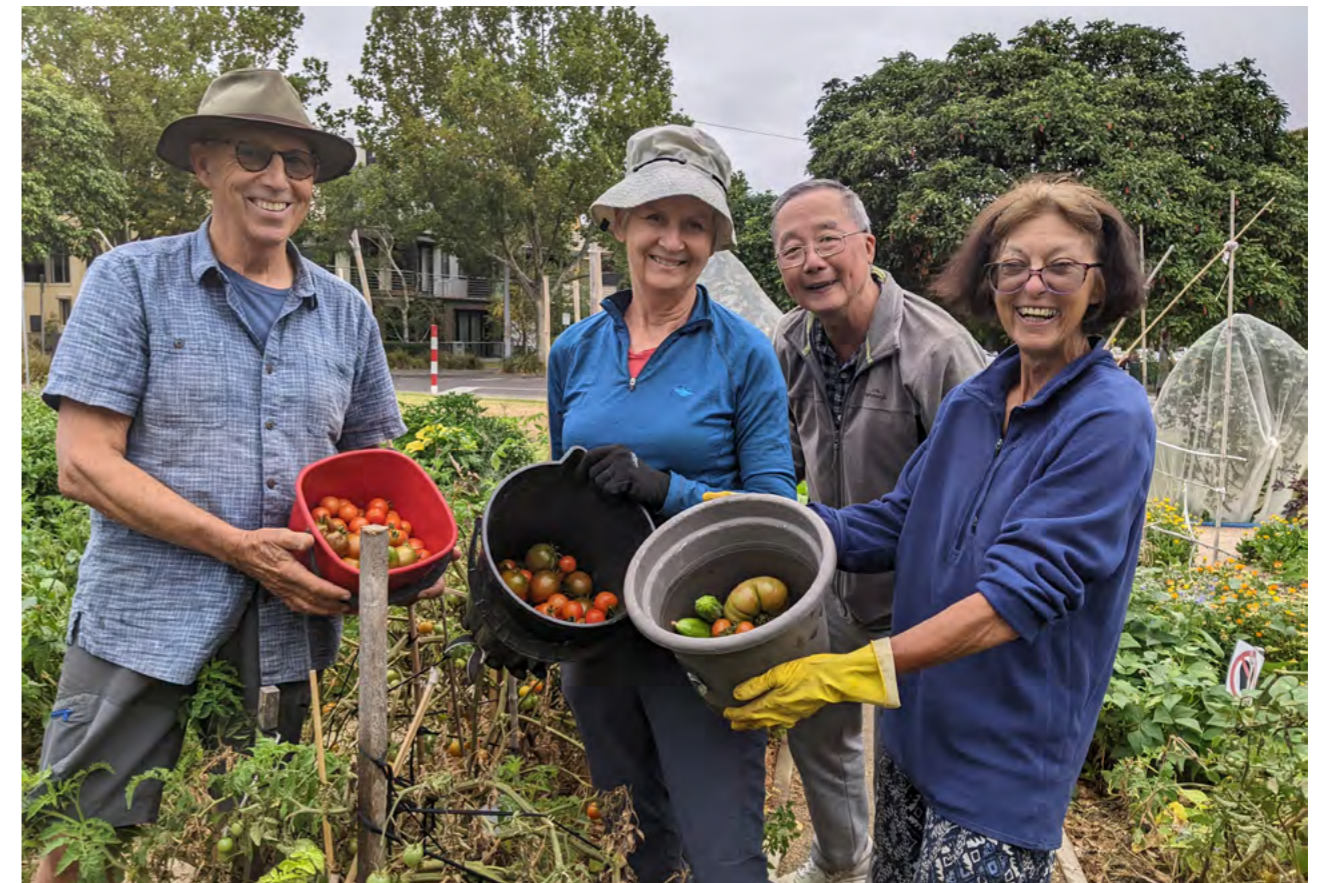
Community garden at the North Carlton Railway Neighbourhood House

As a collective, the Yarra Neighbourhood House Network is able to strengthen our capacity for action and amplify the influence of each of our individual houses. By building collective knowledge around community needs and issues and sharing skills and expertise, we are constantly innovating and growing. Through the development of this shared Climate Action and Resilience Plan , we are developing a mutual understanding of the impacts of climate change on our local communities and a shared commitment to embedding sustainability and resilience across our houses and communities.