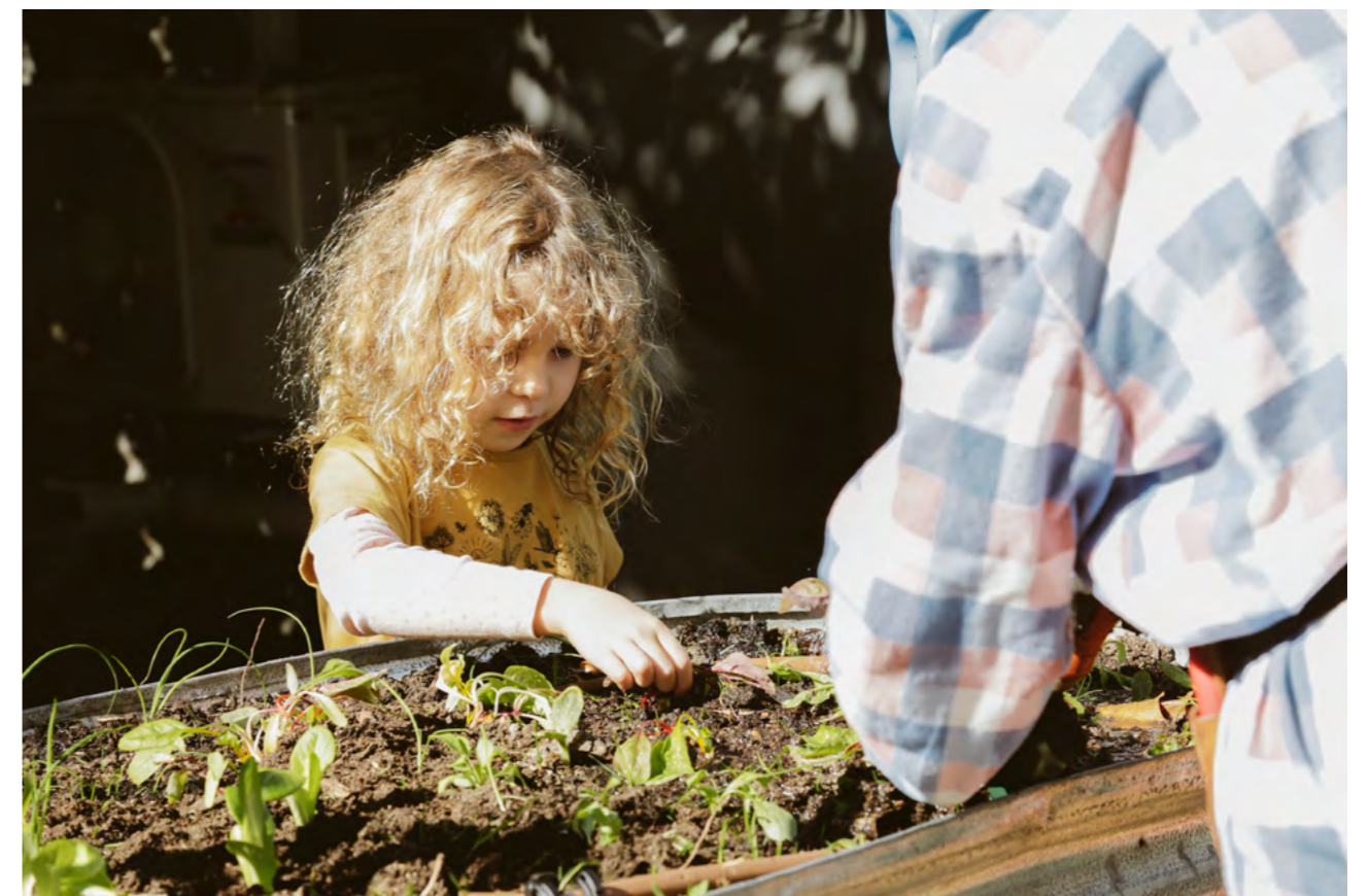
Community garden at the Alphington Community Centre