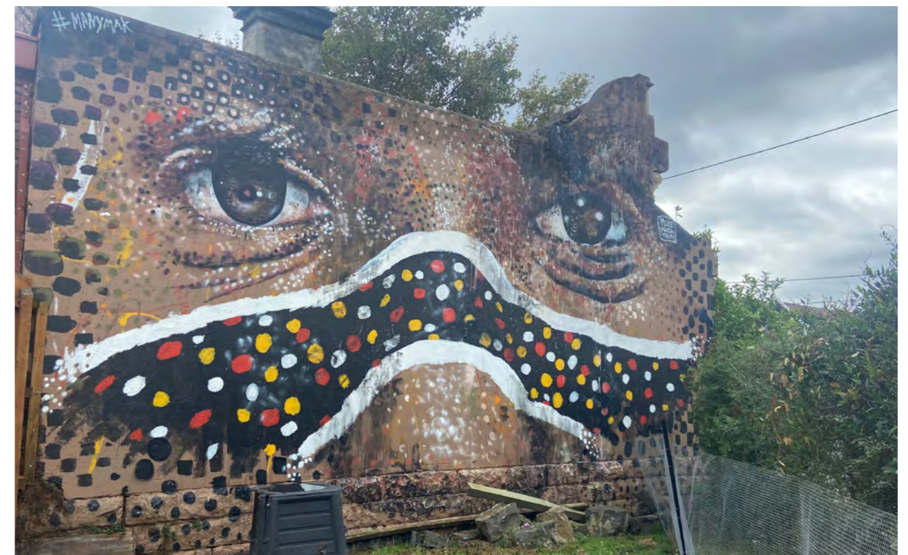
Ballum Ballum garden at the Carlton Neighbourhood Learning Centre