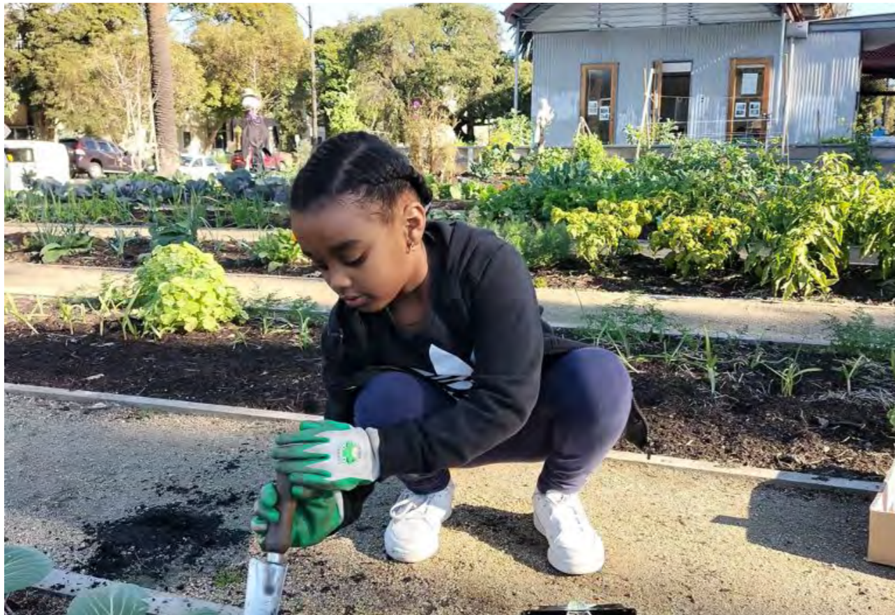
Community garden at the North Carlton Railway Neighbourhood House