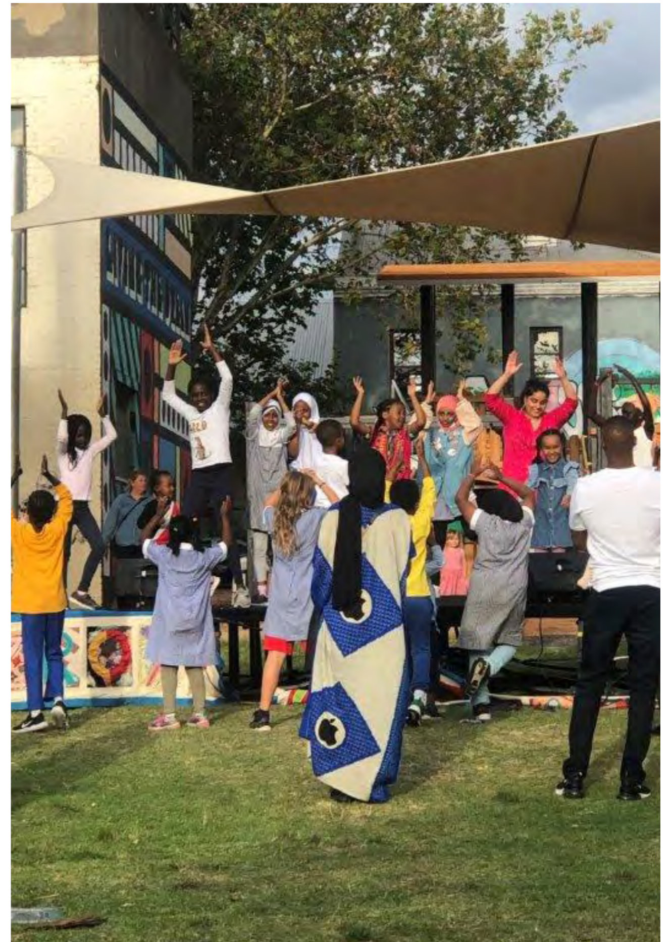
Community event at the Fitzroy Learning Network